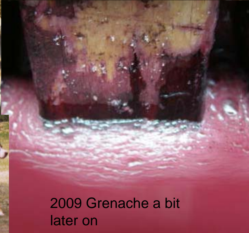
2009 Grenache a bit later on