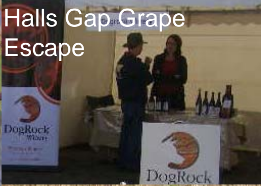
Halls Gap Grape Escape