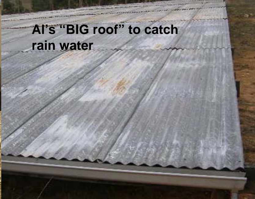
Al's "BIG roof" to catch rain water